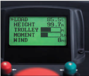
A flexible graphic display provides excellent feedback to the user.