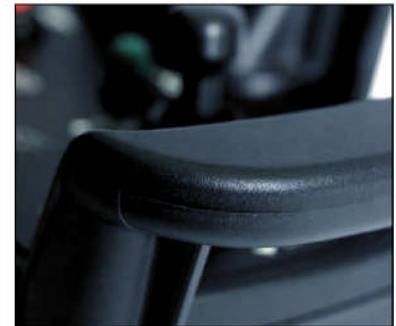
The case is impact resistant and can withstand UV light, chemicals, heat, cold and humidity. The ergonomic design makes it comfortable and easy to keep hold of even when using working gloves.