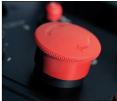
Activation of the stop button puts the system in a safe stop mode within 0.5 seconds.