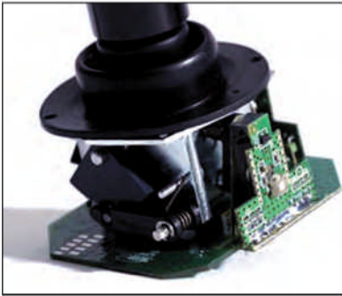
Robust and ergonomically designed joysticks made of tempered steel with low static stress on joints.